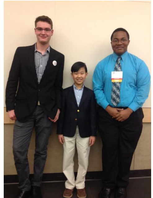
Last year's composition contest winners

Complete Details and Application Information will be available in September in the Annual Conference section of the PMEA website under the Conferences and Events menu option. Deadline for submissions is December 20.